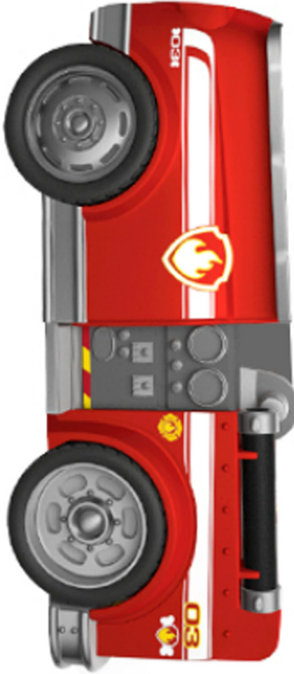
BACK OF CAR