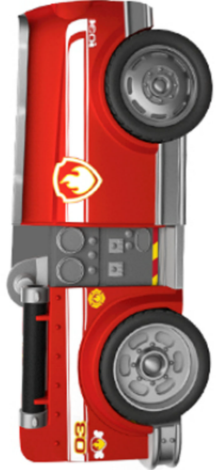
BACK OF CAR