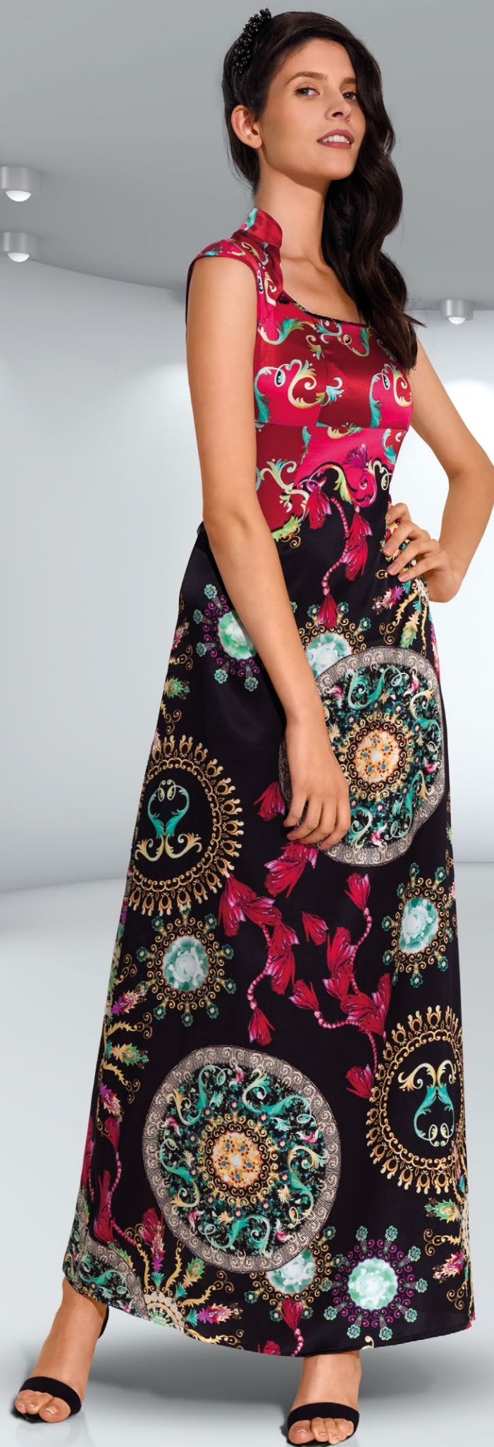
dress art. M2600-R size: 42, 44, 46, 48, 50, 52 97% silk, 3% elastane