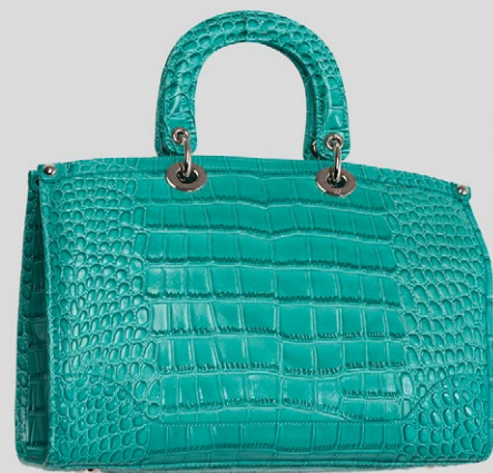
page 1 handbag art. M703-B