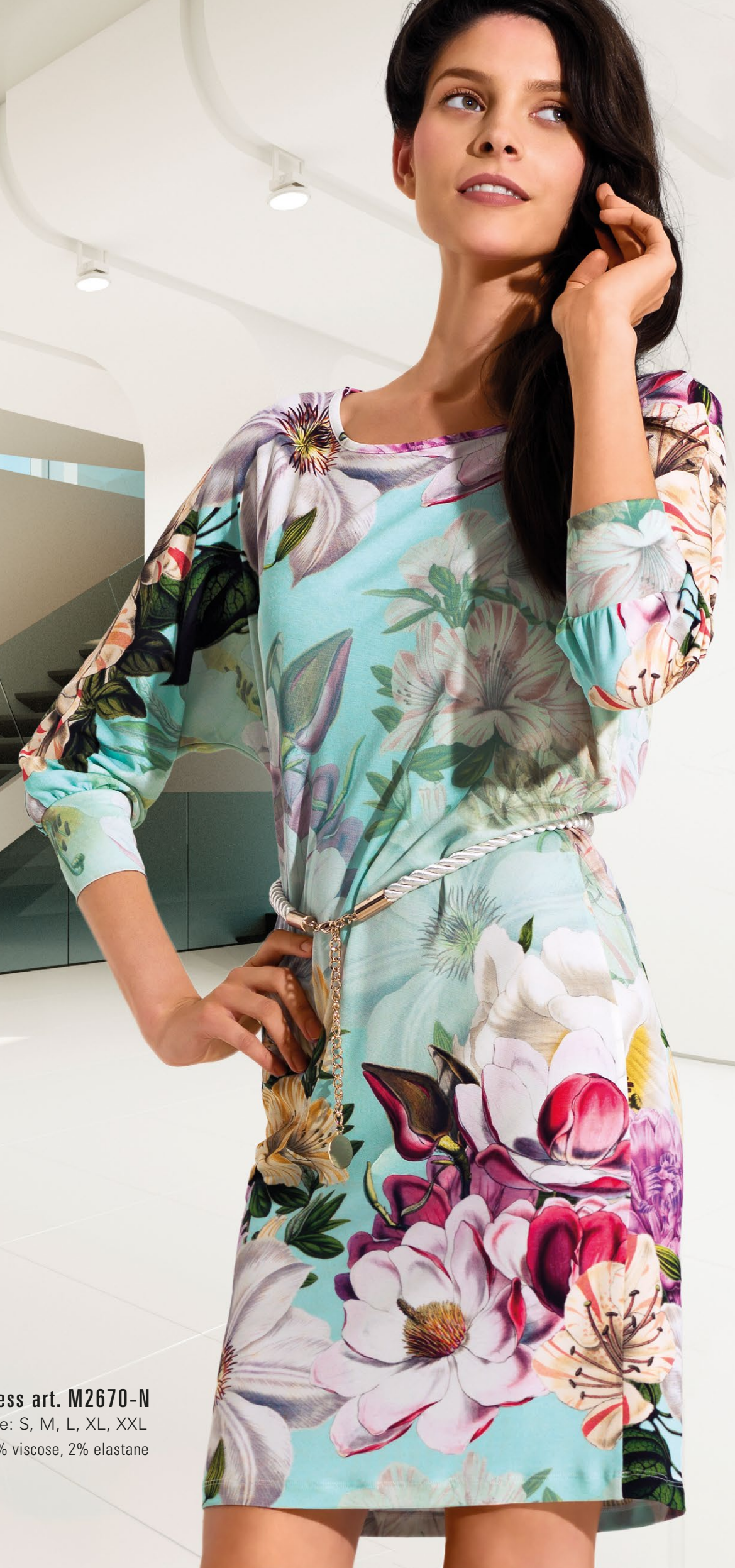
dress art. M2670-N size: S, M, L, XL, XXL 98% viscose, 2% elastane