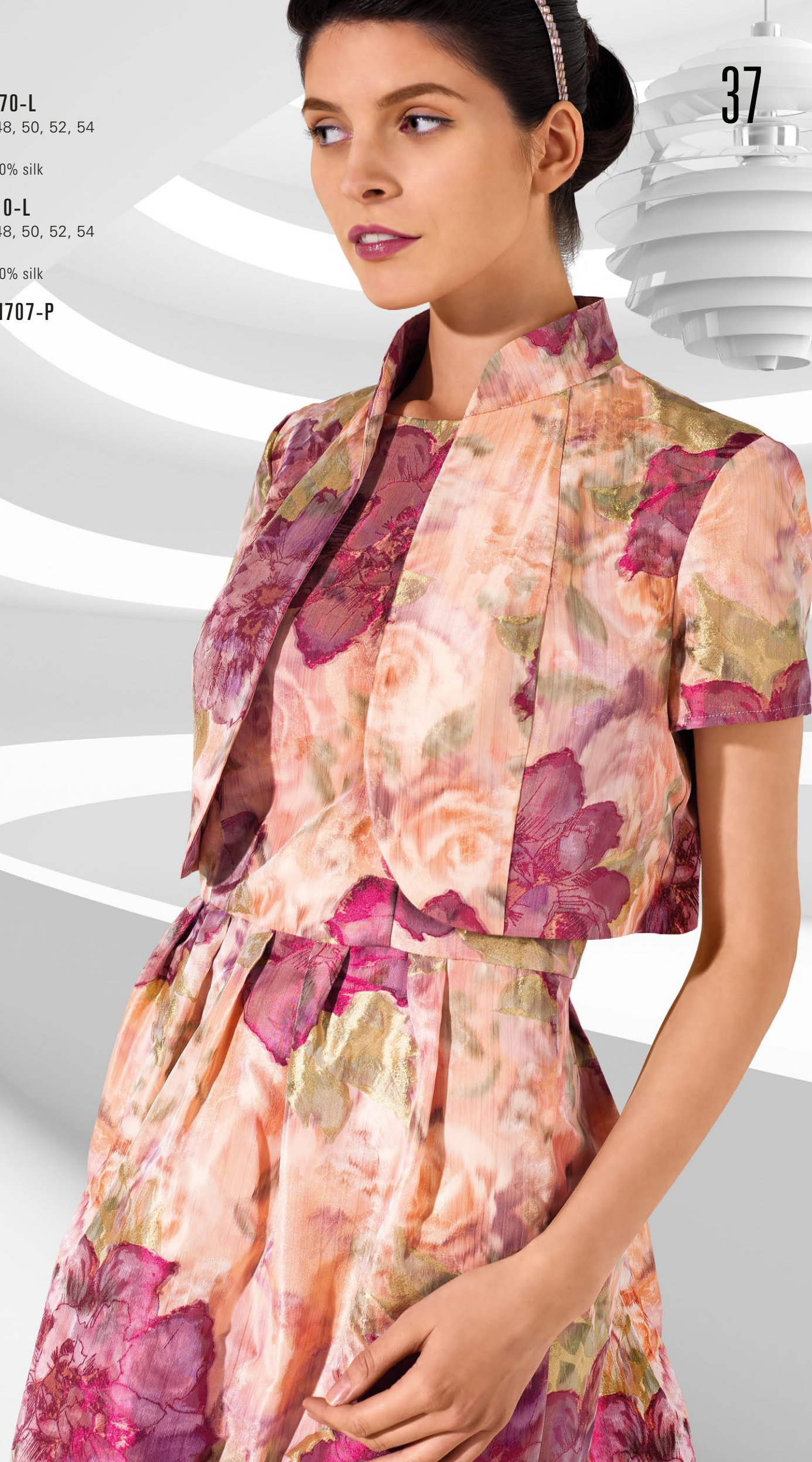
hair hoop art. M707-P