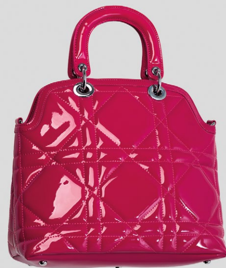
page 10 handbag art. M703-B