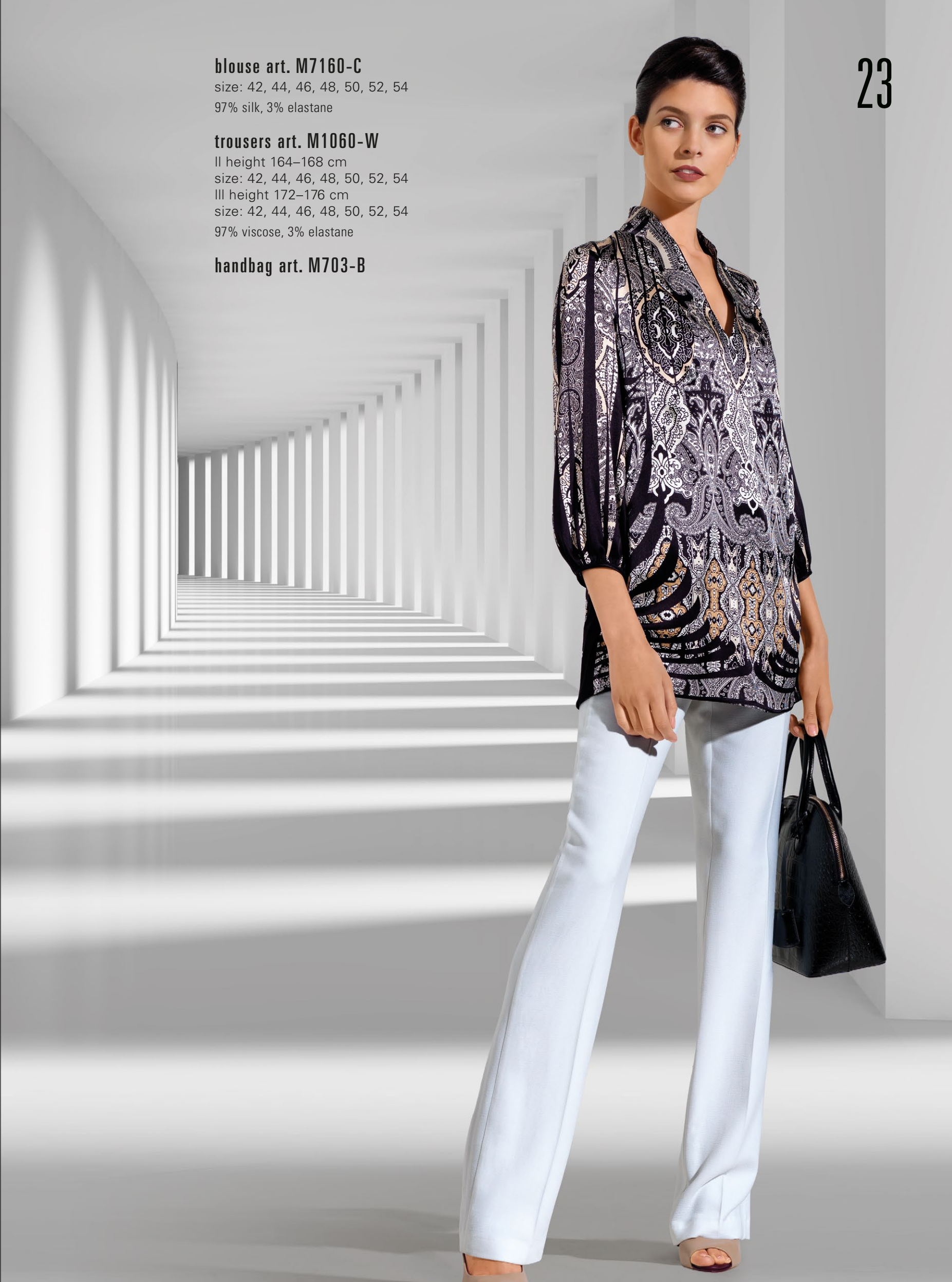
blouse art. M7160-C size: 42, 44, 46, 48, 50, 52, 54 97% silk, 3% elastane