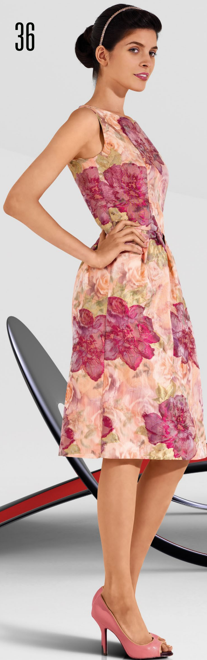
dress art. M2610-L size: 42, 44, 46, 48, 50, 52, 54 100% polyester lining: 70% cotton, 30% silk hair hoop art. M707-P