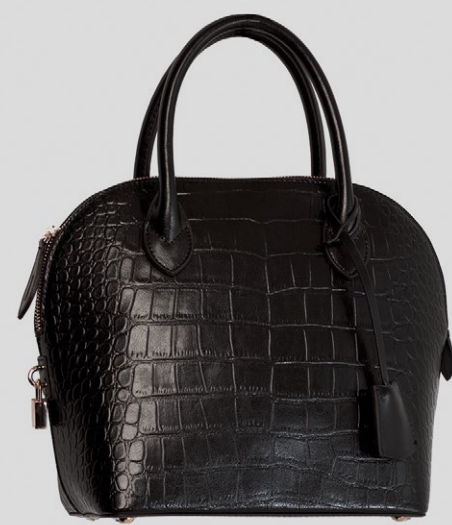
page 12 handbag art. M703-B