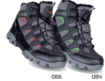
130295 Trek Boots