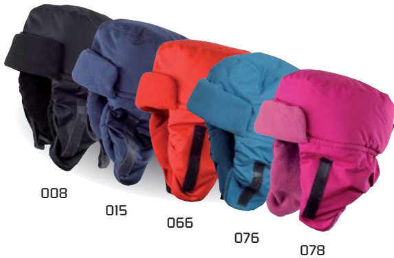
130224 Laban cap