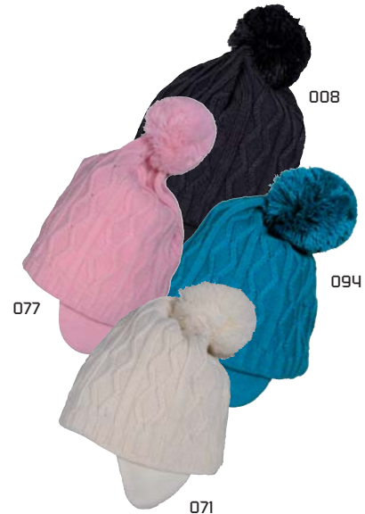
130221 Cap knitted classic