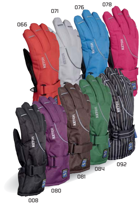
130264 Ski gloves