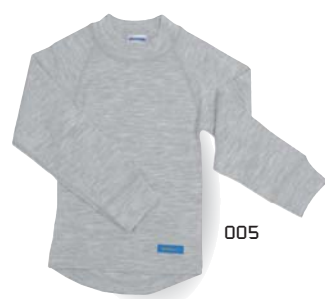
130276 CoolDry top