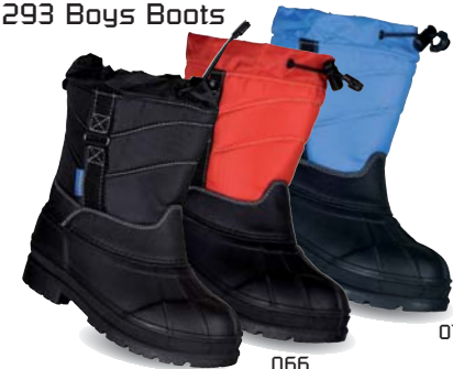
130293 Boys Boots