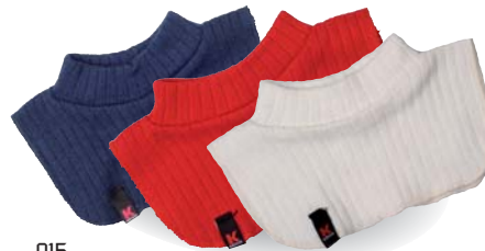
130229 Polo, knitted