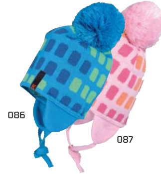
130223 Cap knitted, digital