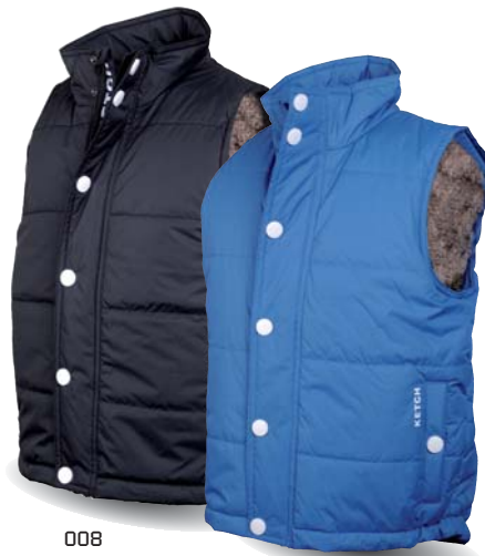
130283 Vest boys