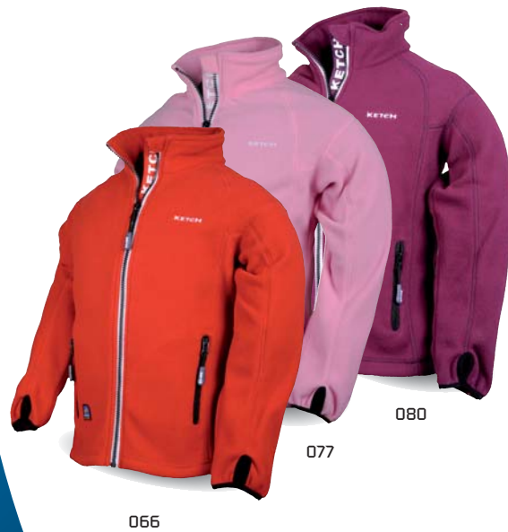
130272 Ski fleece jacket girls