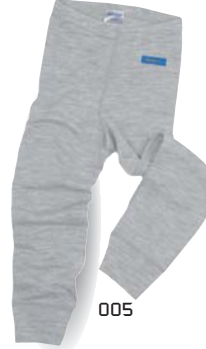
130277 CoolDry pants