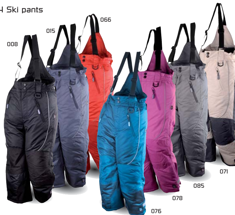
130244 Ski pants