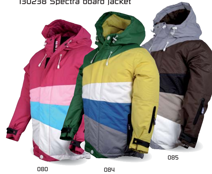
130238 Spectra board jacket