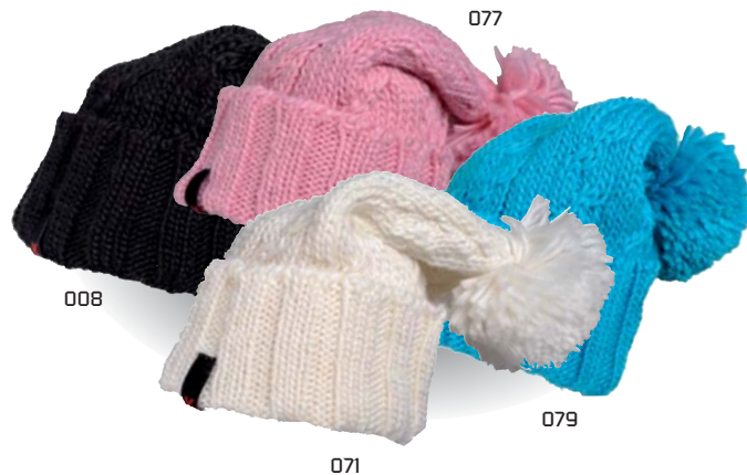
130298 Cap knitted classic