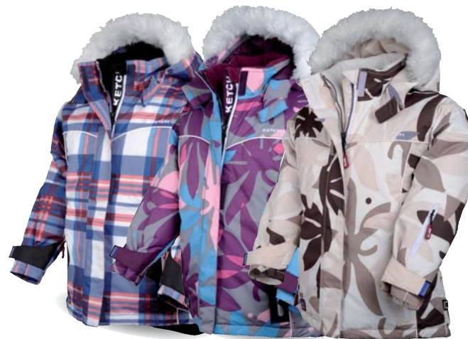
130232 Iceflower ski jacket