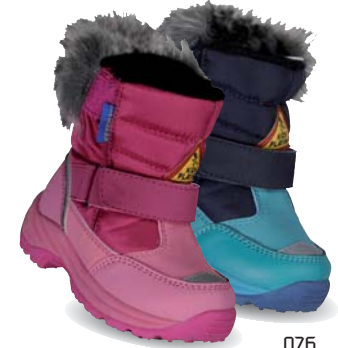
130291 Baby Boot