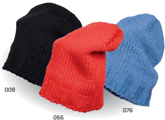
130227 Cap knitted flat