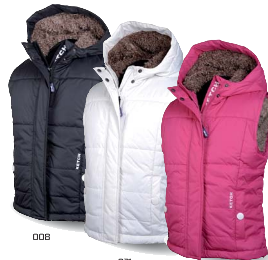
130284 Vest girls