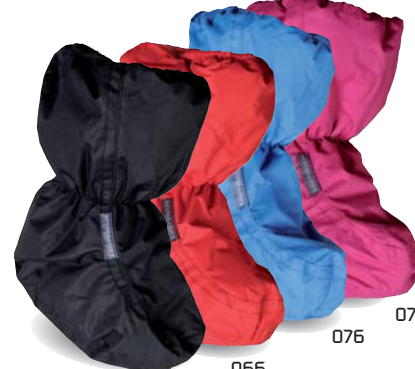
130268 Socks, woven