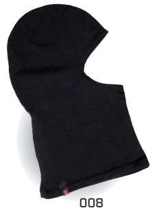
130228 Balaclava, knitted