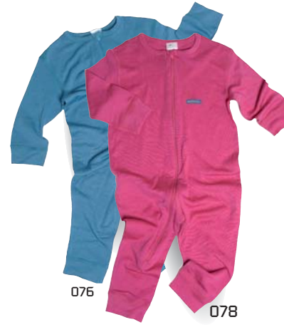
130273 Baby Body, underwear