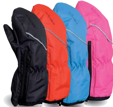
130266 Mitten, zip