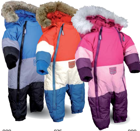
130251 Overall, vintage