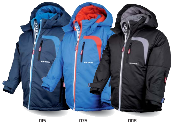
130233 Bow ski jacket