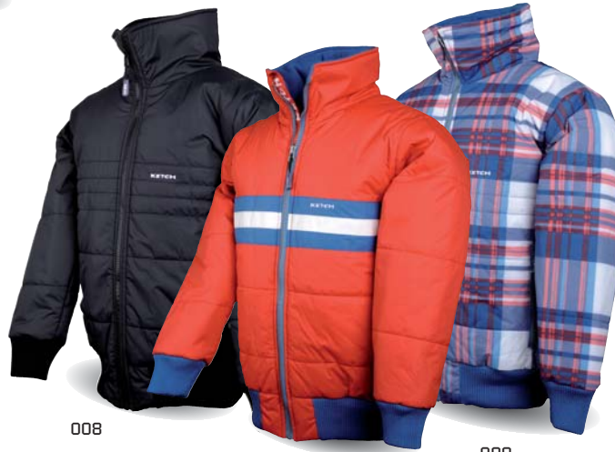
130237 Ski retro jacket