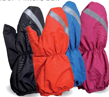
130267 Mitten, soft