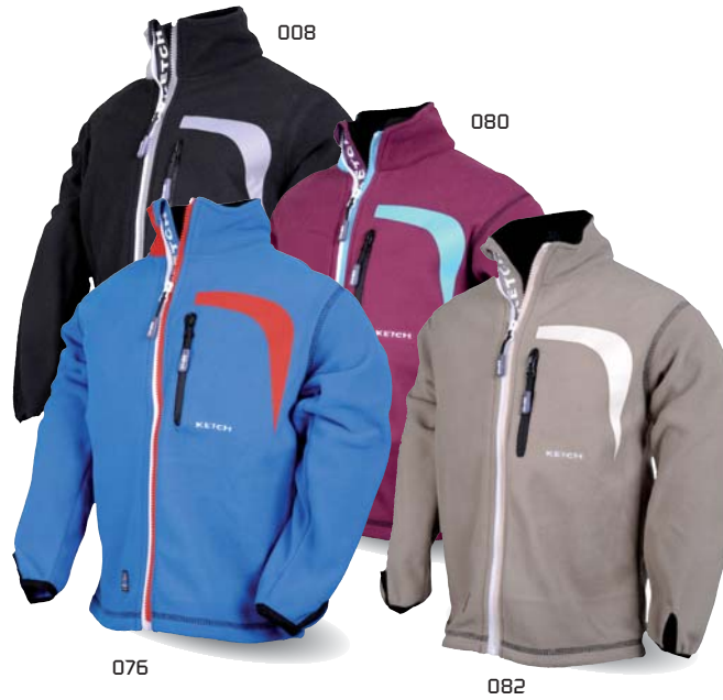
130271 Ski fleece jacket boys