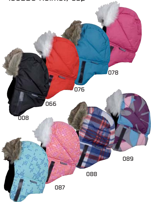
130220 Helmet, cap