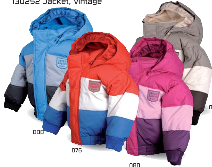
130252 Jacket, vintage