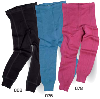
130279 Merino wool pants