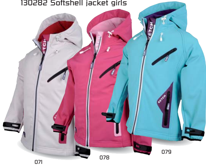
130282 Softshell jacket girls