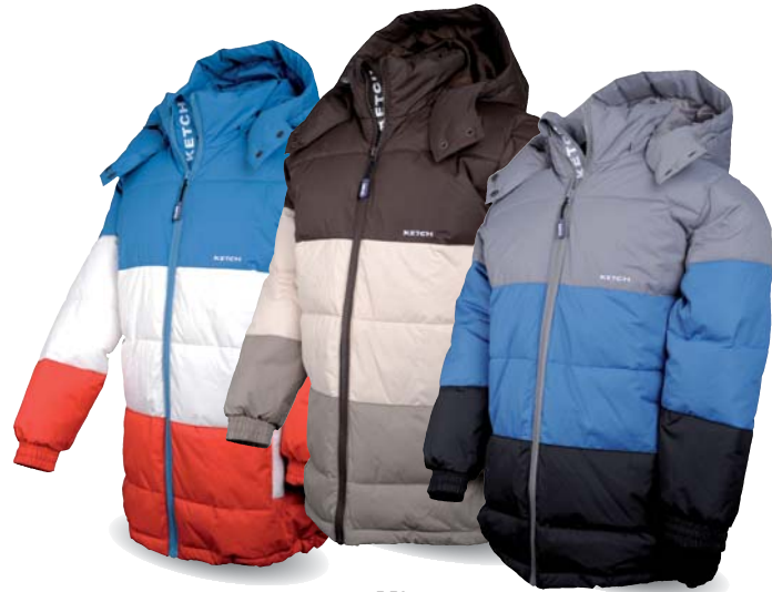
130235 Boys vintage jacket