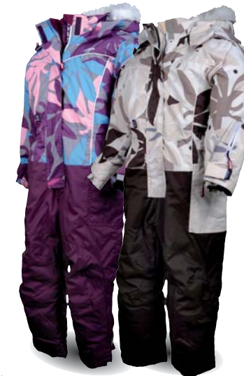
130212 Iceflower ski overall