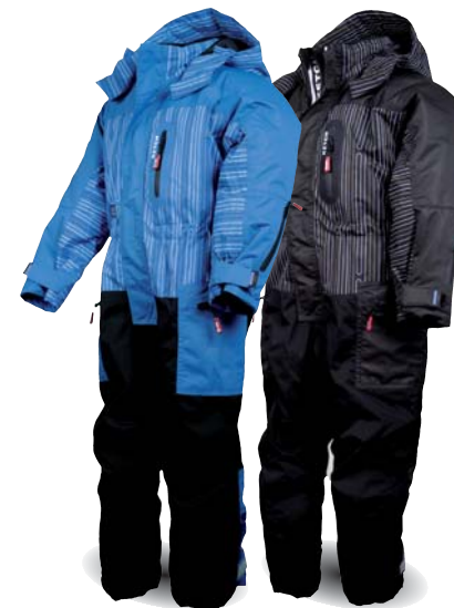
130211 Stripes ski overall