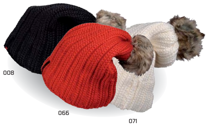
130226 Cap knitted fur ball