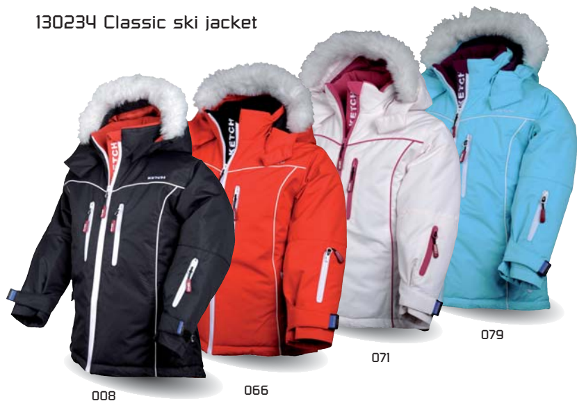
130234 Classic ski jacket