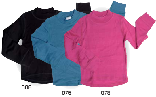
130278 Merino wool top