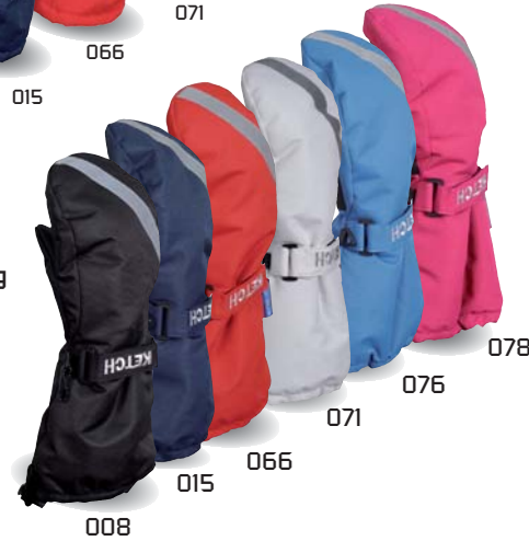
130263 Mitten long