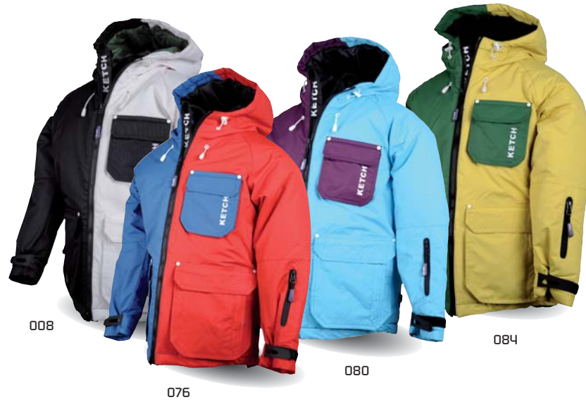
130239 Split board jacket