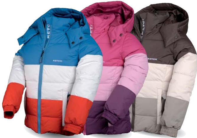
130236 Girls vintage jacket