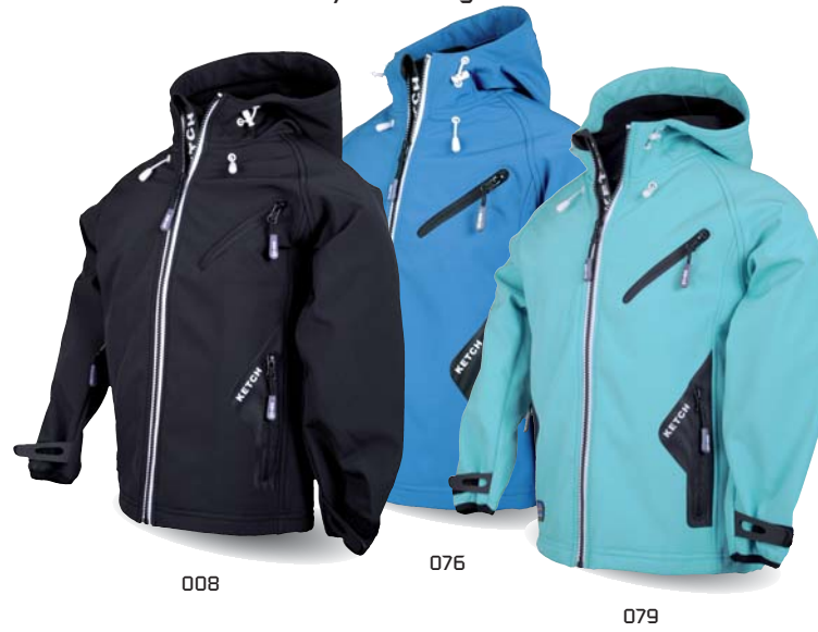
130281 Softshell jacket boys