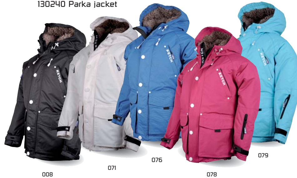
130240 Parka jacket