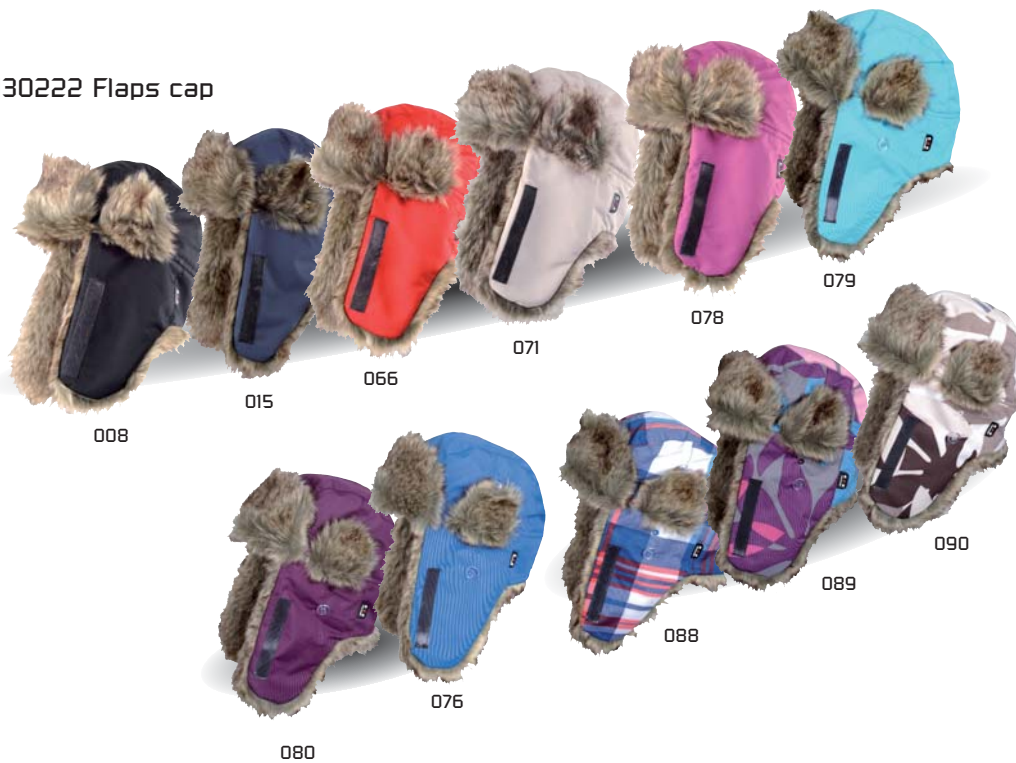
130222 Flaps cap