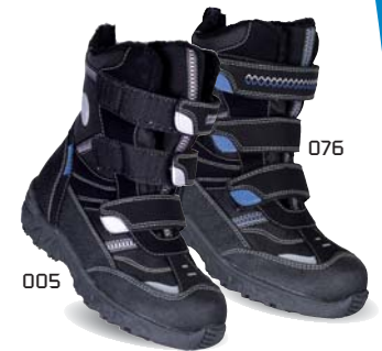
130294 High Boots