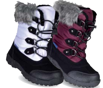
130292 Girls Boots