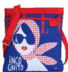
SHOPPING IN PARIS